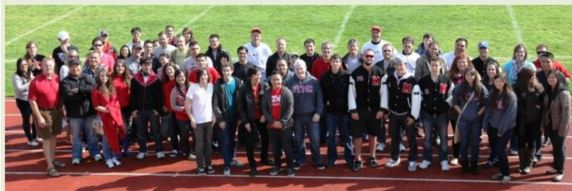
Alumni group shot at half time.